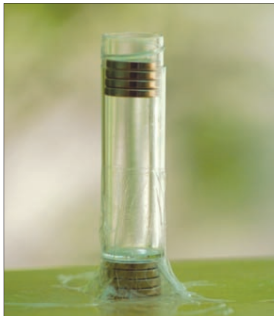
Fig. 4. The “magnetic piston” was made using two magnet stacks and a clear plastic coin tube. The lower stack of four magnets is taped to the tabletop to prevent rotation due to magnetic torque from the floating upper stack. The walls of the plastic tube (also taped securely) prevent significant rotation of the floating stack. A finger may be inserted to push down on the upper stack and force it to move until it comes to a force balance position.

would lead us to expect only a 10% error. It is thus likely that there was some influence of the vertical component of the Earth’s field, which at the latitude this experiment was performed is much larger than the horizontal component. If this is the case, the experiment should work better at lower latitudes than those of central Canada, where our run was done, since the Earth’s magnetic field would be more horizontal. It would also be possible to devise a better form of mounting if a machine shop is available, perhaps taking inspiration from historical instruments. 4 The intent of this paper was to show how to get meaningful results with the simplest possible equipment, so the inaccuracy is not of much concern here.